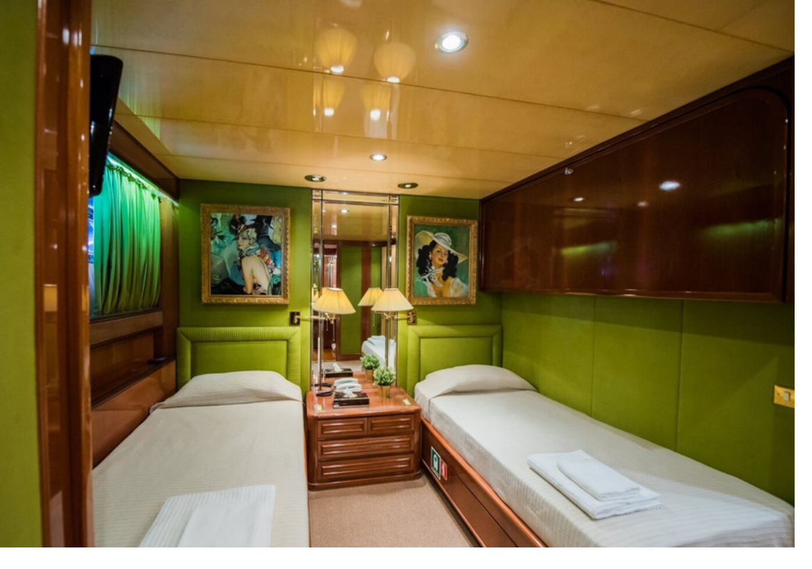
All cabins have en-suite facilities