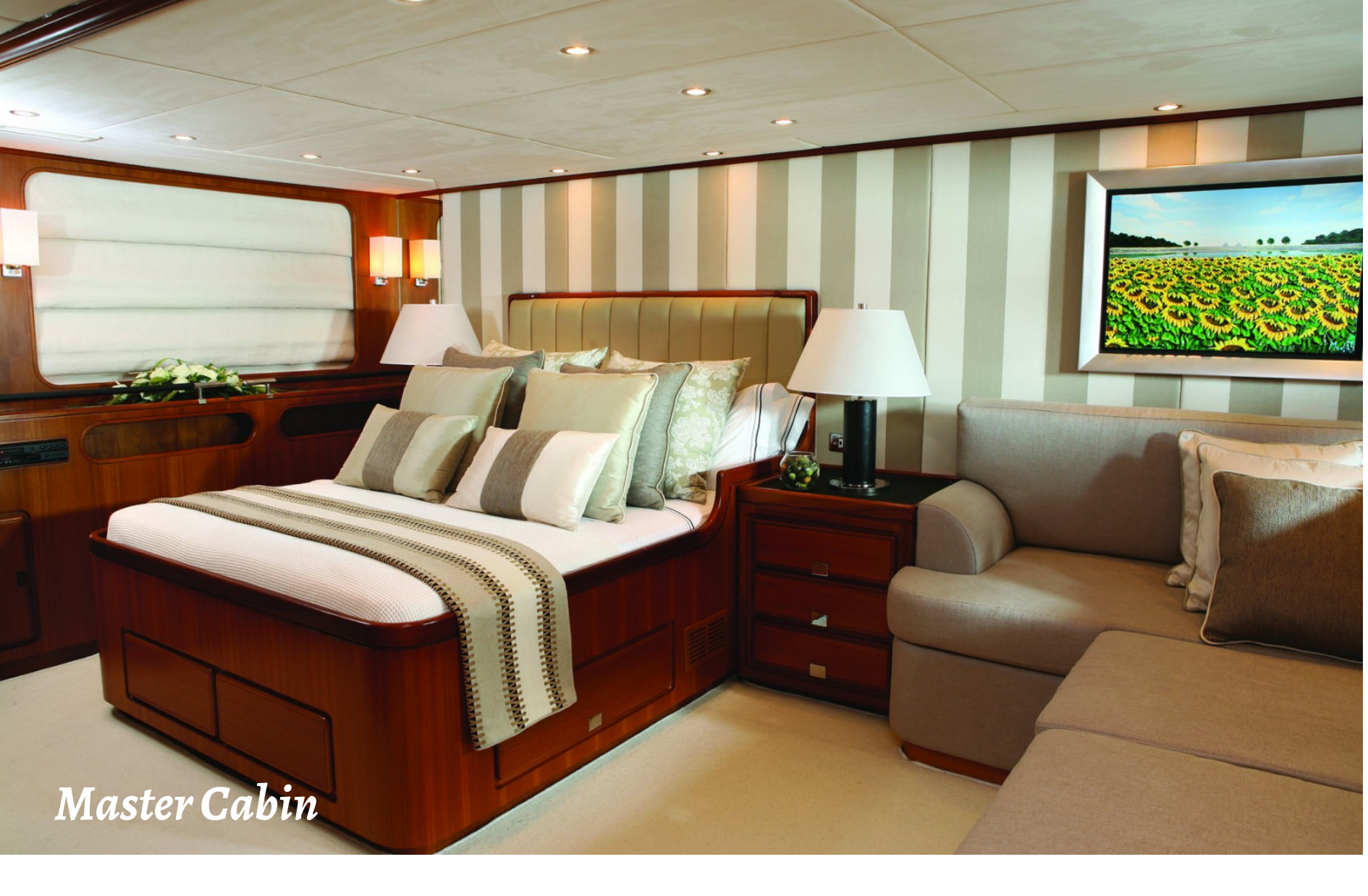
Master cabin on the lower deck with double bed