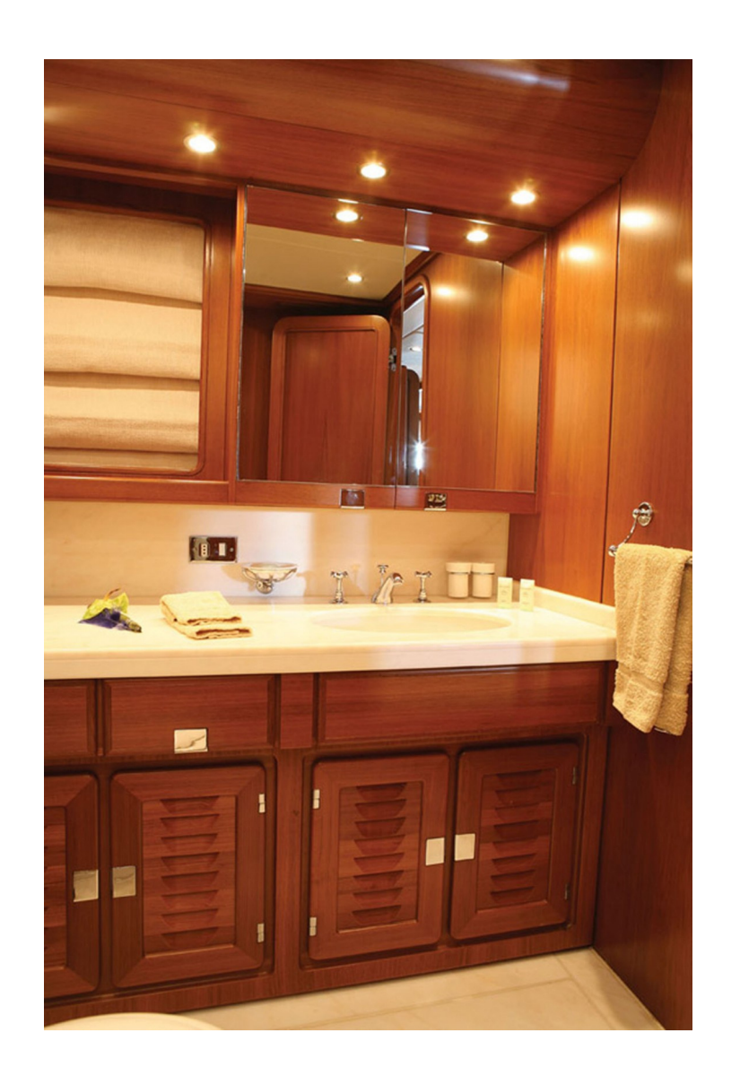
En-suite facilites in all cabins